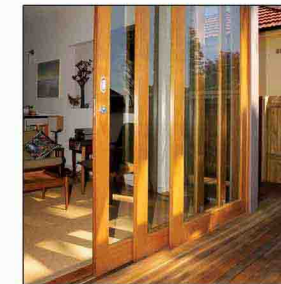
:: Sliding Stacker Doors.